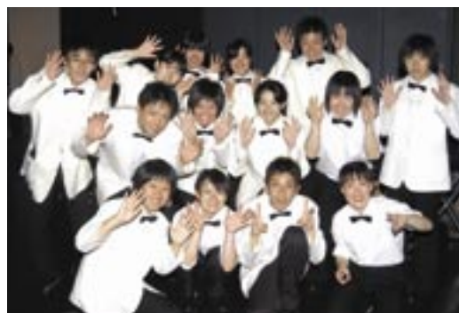
Above: Members of the Saitama Sakae Wind Orchestra from Japan backstage after their standing ovation concert.