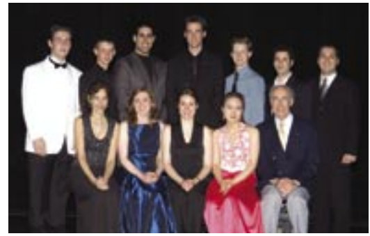
2004 YYPA winners, with guest artist Eugene Rousseau (front row, right)

Watch for ticket details on www.bands.org and in the January/February 2005 Bands of America Newsletter, or call 800.848.2263.