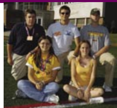
Recipients of the L.J. Hancock Summer Symposium Scholarships for 2004. Visit RevelliFoundation.org to learn about each of the recipients.