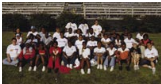
Indianapolis Public Schools Symposium Scholarship recipients at the 2004 BOA Summer Symposium.