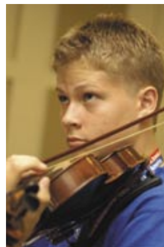
Right: Students from across the nation participated in the second year of the student Orchestra Division.

Mark your calendars for the 30th annual Summer Symposium June 27-July 2, 2005 Illinois State University, Normal, IL