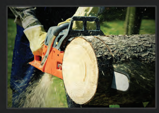
A) This Chainsaw