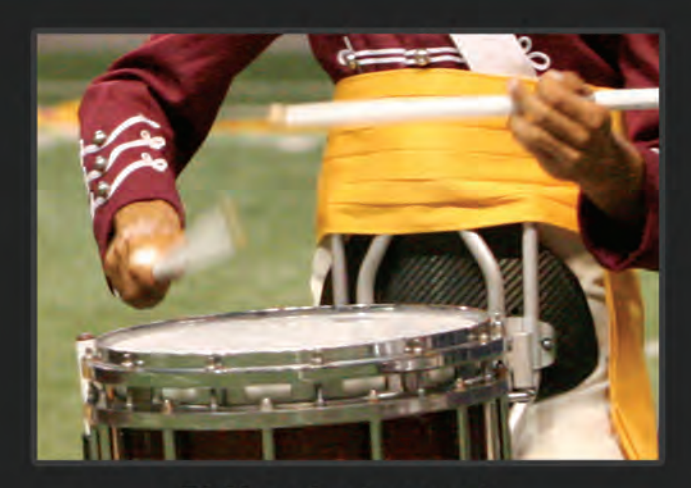
B) Your Instrument