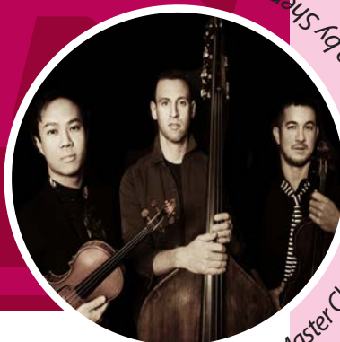
Time for Three – Master Class and In Concert