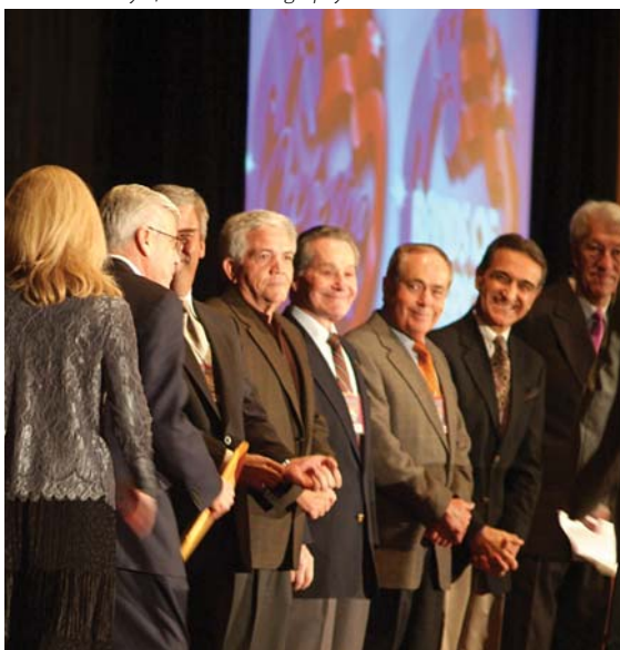
Top: Festival participants await the start of the Opening Ceremony, which was followed by a private performance by the Indianapolis Symphony Orchestra.